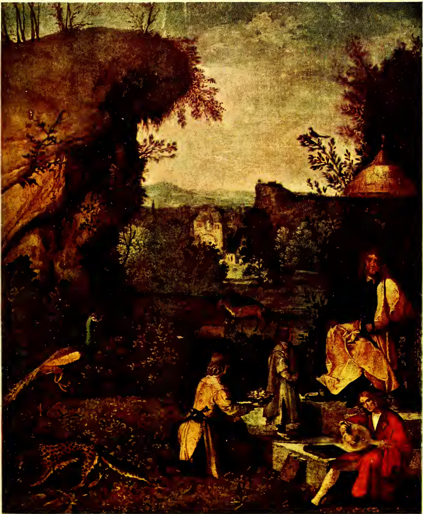
"THE GOLDEN AGE."

From the picture by Giorgione, in the National Gallery, London.